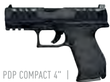
| PDP COMPACT 4" |

The PDP Full size is available with 4", 4.5", or 5" barrel and the PDP Compact with 4" and 5" barrel length.