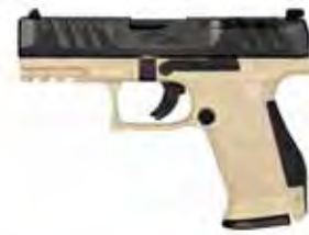
| PDP Compact FLAT DARK EARTH |