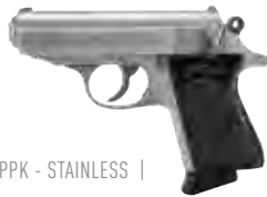
| PPK - STAINLESS |