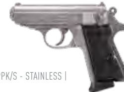
| PPK/S - STAINLESS |