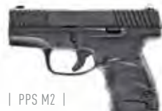
| PPS M2 | 7 shots