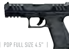
| PDP FULL SIZE 4.5" |