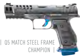
| Q5 MATCH STEEL FRAME CHAMPION |