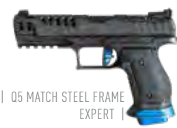
| Q5 MATCH STEEL FRAME EXPERT |