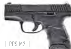
| PPS M2 | 8 shots