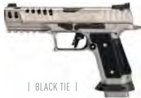
| BLACK TIE |

The Q5 Match SF Editions: aesthetically already staking their claim as a legend. These valuables are unmistakable eye-catchers that set standards second to none. This is reflected inside and in the technical properties without any compromises: Superior trigger characteristics and ultimately better hitting as a consequence of Walther's Dynamic Performance Trigger. This competition trigger with its distinctive aluminum finger rest is made for dynamic shooting: short take-up, little over-travel and fast reset. At the point of release, the trigger with its flat trigger blade breaks like glass at 2.5 kilograms.