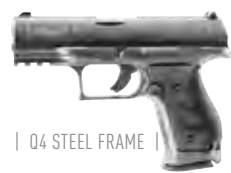
| Q4 STEEL FRAME |

The Q-Series Steel Frame is a remarkable triumph made possible only by Walther's superior standards. Despite common misconceptions, you can buy performance.