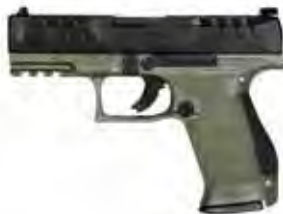
| PDP Compact OD GREEN |