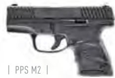
| PPS M2 | 6 shots

The PPS M2 Series is a revolutionary yet practical concept. Delivering the premier concealed carry option with unprecedented accuracy and comfortability, capable of withstanding anything thrown in its way. Upon its release, the PPS series transformed the industry by introducing a polymer single-stack concealed carry pistol, effectively establishing a trend that remains popular still today. The PPS M2 is a more refined version of that original design, now measuring only 1" thick! It is the ultimate representation of Walther's world-renowned performance catered to the expectations of the modern shooter.