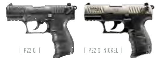
| P22 Q |