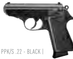
| PPK/S .22 - BLACK |