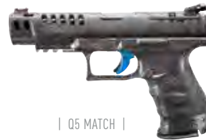
| Q5 MATCH |