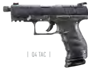
| Q4 TAC |

Time-tested performance meets technological precision with the Walther Q-Series polymer handguns. Optic-equipped handguns have undoubtedly risen in popularity over the last few years. With practice, the right optic can help you become a faster and more efficient shooter. The Q-Series of pistols are uniquely designed to give you the flexibility you need to swap from iron sights to optics easily. Built for right and left-handed shooters, the Q-Series pistols feature an ambidextrous slide stop and reversible button-style magazine release.