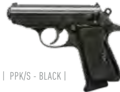
| PPK/S - BLACK |