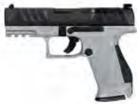
| PDP Compact TUNGSTEN GREY |

No other handgun can put all the tools you need at your disposal like the Walther PDP. It's a handgun specifically designed to maximize readiness no matter the circumstance, and with the support of Walther's historic ingenuity, its guaranteed to surpass all expectations time and time again. The unique design offers versatile advantages when you need them most, providing supreme performance in any condition, making this go-to choice for shooters who demand excellence every single day.