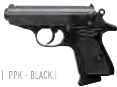
| PPK - BLACK |

Timelessness inspires true greatness. A groundbreaking idea now gives rise to the next level of achievement in unrivaled performance, delivering tried-and-true results when you need them most. Walther's industry-leading innovation takes the spotlight with their PPK model handguns. At the time of its invention over 80 years ago, the PPK inspired an entirely new category in the firearm industry, now widely known as the concealed carry pistol. To fill the need for performance in a concealable package, Walther broke the mold of pocket pistols and full-size military pistols to bring undercover officers a more practical option, the PPK. Chambered in .380 ACP, the PPK provides all the power needed in a self-defense pistol without sacrificing on critical functionalities.