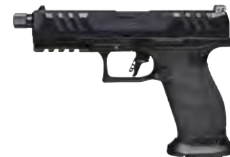
| PDP Full Size PRO SD |