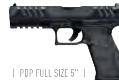
| PDP FULL SIZE 5" |