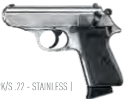
| PPK/S .22 - STAINLESS |