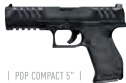
| PDP COMPACT 5" |