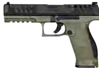
| PDP Full Size OD GREEN |