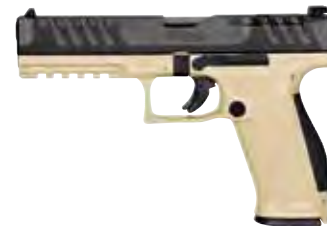
| PDP Full Size FLAT DARK EARTH |