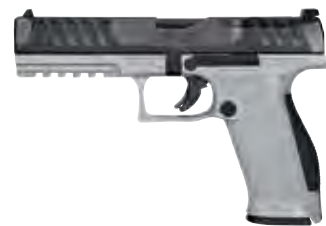
| PDP Full Size TUNGSTEN GREY |