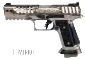
| PATRIOT |