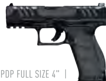
| PDP FULL SIZE 4" |