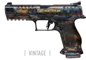
| VINTAGE |