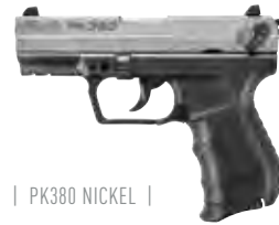
| PK380 NICKEL |