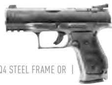
| Q4 STEEL FRAME OR |