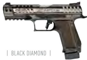
| BLACK DIAMOND |