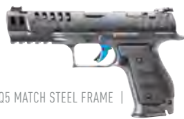
| Q5 MATCH STEEL FRAME |