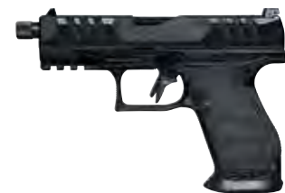
| PDP Compact PRO SD |