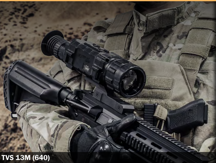
TVS 13M (640)