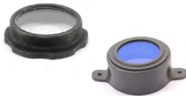
NVS DS and NVS SW

Lightweight Tactical Head Gear for NVS S mount with all Night Vision Monoculars and Goggles; One size fits all: three adjustment dials allow for comfort adjustments to any head size or shape.