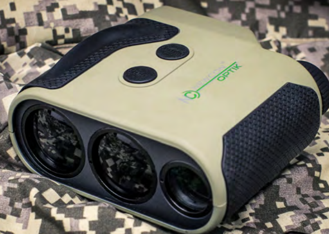
LRM 2200SI NSN# 1240-20-009-0287