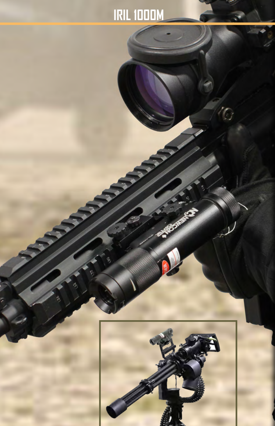
IRIL 1000M mounted on M134 Minigun

The IRIL 1000M long-range infrared aimer and illuminator now features a high-powered visible laser aiming channel. This device is designed to reach out to extreme distances to aid in target identification and engagement from ground- and air-based platforms. Equipped with a Picatinny quick release mount, the IRIL series of illuminators can be mounted on virtually any rifle or crew-served weapon system. The IRIL 1000M has 5 in-built laser patterns to select from to aid in laser identification.