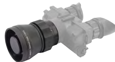
NVS Lens 4x

Afocal 3x magnification add-on lens for monoculars and goggles