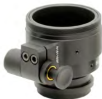
NVS U Coupler

Catadioptric 4x magnification add-on lens for goggles