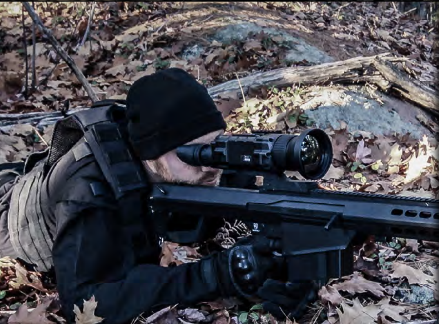
TVS 13M (640-75)