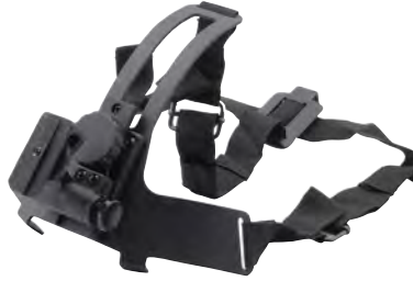
NVS H Mount

Shroud-compatible helmet mount for monoculars and goggles