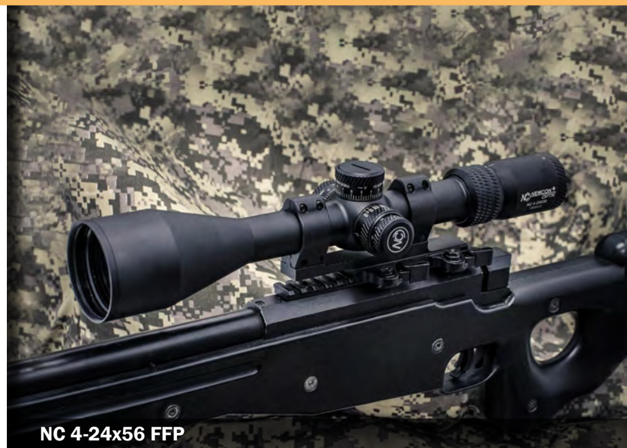
NC 4-24x56 FFP