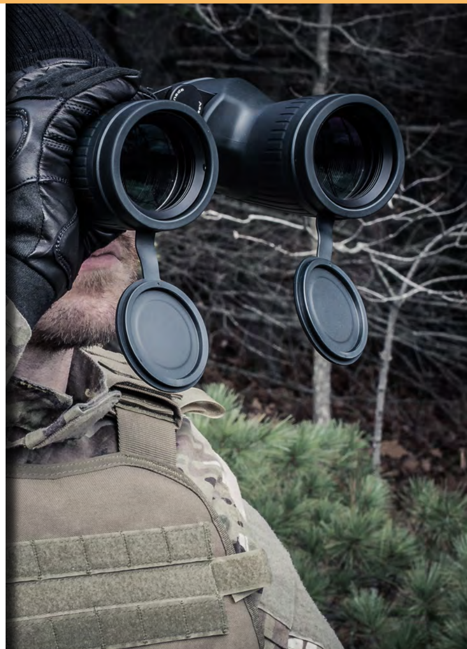
AN 10x50M22 shown in photo