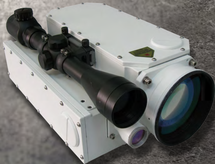
LRF MOD 25HFLC

The LRF MICRO 1550 and 1550 (CI) utilize a 1550nm laser that cannot be seen by image-intensified night vision systems. Each 'CI' variant incorporates a digital magnetic compass and inclinometer for vector measurement and enhanced spatial data collection.