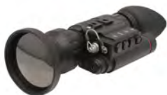
Shown with 2x afocal lens