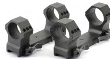
30mm QR Scope Mount & 34mm QR Scope Mount

Anti-reflection filter for use with NC 4x32, NC 6x50, and HDS 3AA