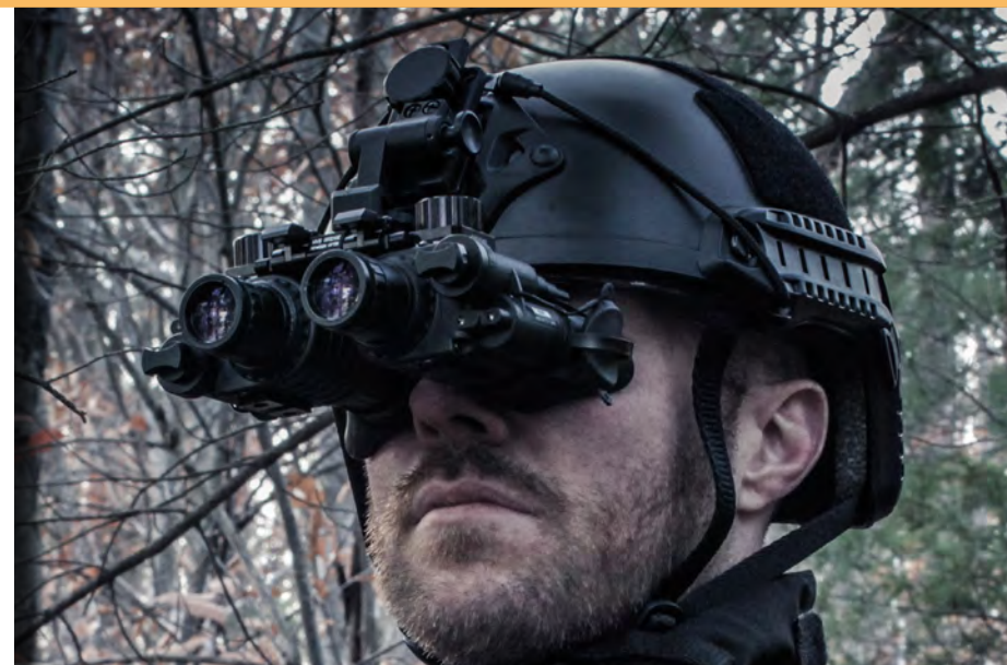
NVS 15-AG/NVS 15-AGBW