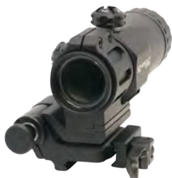
HDS 3x Lens

Newcon Optik's accessories multiply the usefulness of tactical devices by protecting them from glare, and/or by allowing them to be tripod- or weapon-mounted. Newcon Optik also offers optional magnifying lenses for use with the HDS 3AA and NC 1x21.