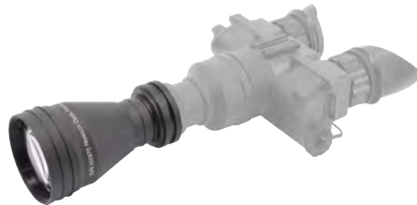
NVS Lens 3x

MIL-SPEC case to protect devices during transportation and storage