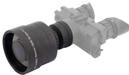
NVS Lens 5x

Connects monoculars and goggles to any Newcon Optik LRF or day optic for night operation