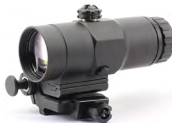
HDS 5x Lens

Flip-to-side 3x magnification add-on lens for use with HDS 3AA