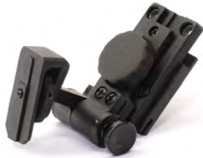
NVS S Mount

Newcon Optik's NVS accessories multiply the usefulness of NVS devices by protecting them from the elements, by allowing them to be head-, helmet-, or weapon-mounted, and by permitting the combination of multiple devices.