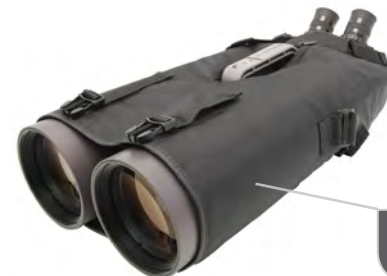
Shown with optional weatherproof case