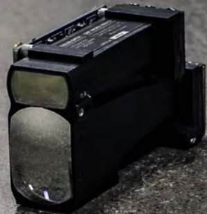
LRF MICRO SERIES