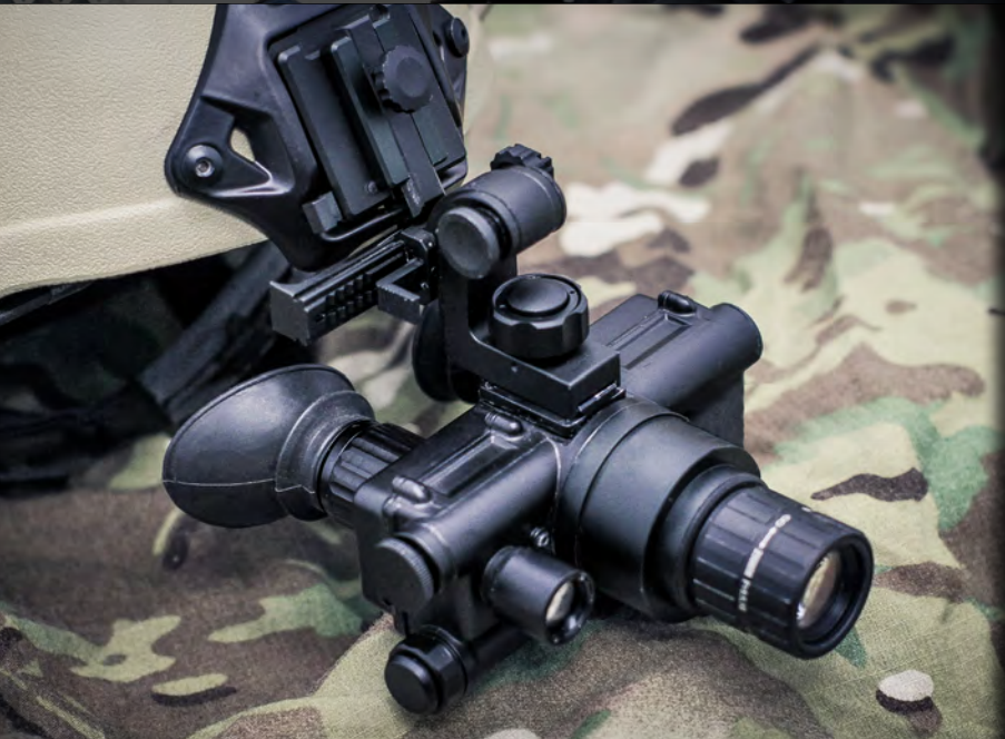
NVS 7-3AG/NVS 7-3AGBW