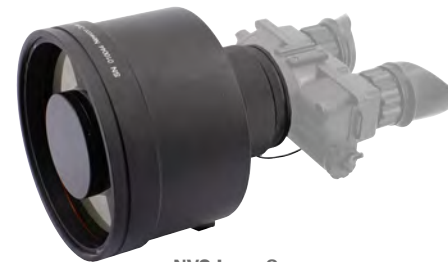
NVS Lens 8x

Catadioptric 5x magnification add-on lens for goggles