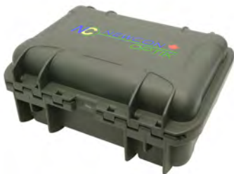
Hard Case (various sizes)

Newcon Optik offers accessories for device transport, to add magnification, or to attach to day-optics for a night vision conversion.