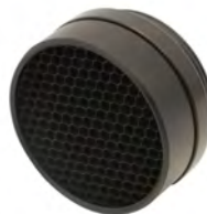
NC 4x32 ARF, NC 6x50 ARF, & HDS 3AA ARF

Wi-fi camera for use with SPOTTER LRF and other communications-enabled devices