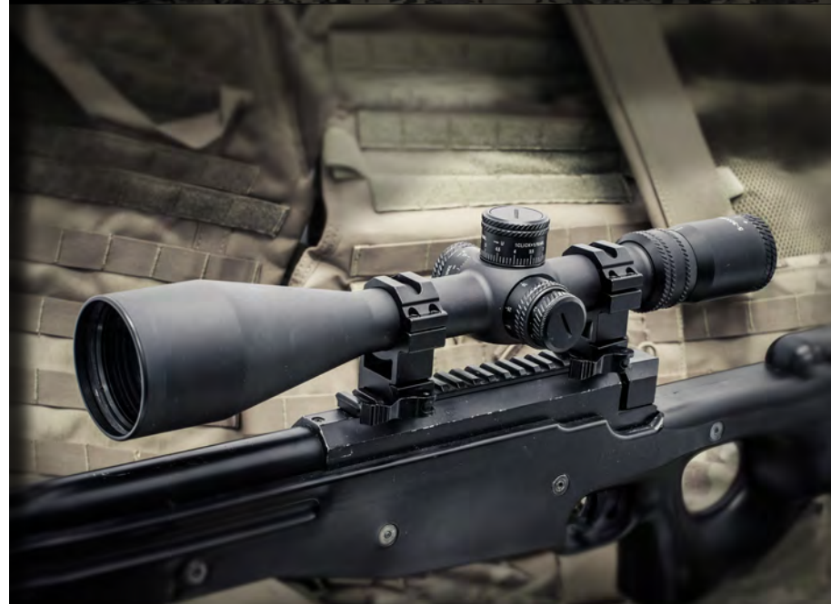
NC 5-30x56 FFP