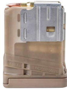
Translucent Dark Earth