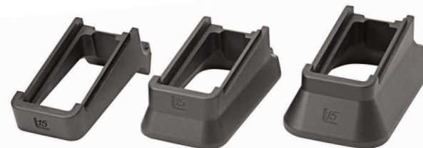
>> L15 Standard, Tactical & Competition Magwells