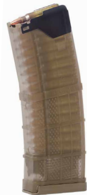
Translucent Dark Earth