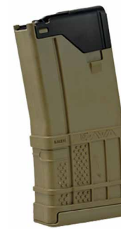
Opaque Flat Dark Earth