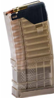
Translucent Dark Earth