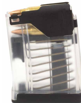
10-Round Body with 5-Round Stop