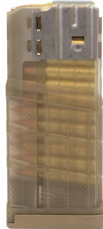
Translucent Dark Earth