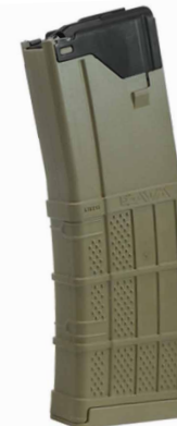
Opaque Flat Dark Earth