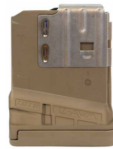
Opaque Flat Dark Earth