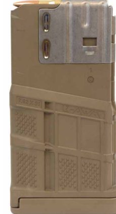
Opaque Flat Dark Earth