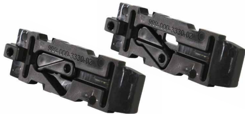
» Lancer Switchable Drain