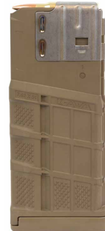
Opaque Flat Dark Earth