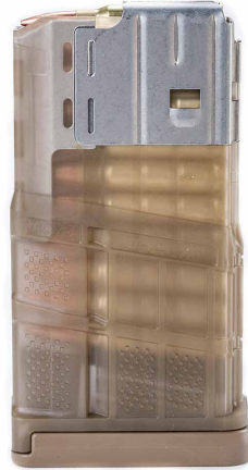
Translucent Dark Earth