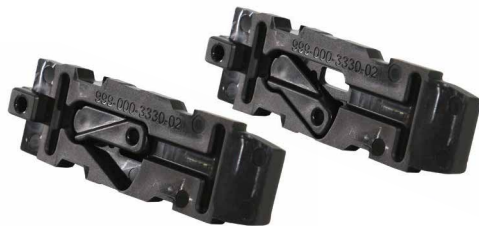
»Lancer Switchable Drain

* Not compatible with ArmaLite B Series, Rock River and SCAR17 Heavy