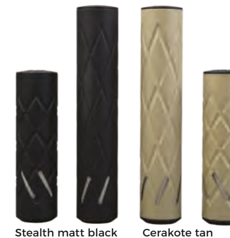
Stealth matt black