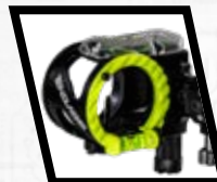
1 PIN HOUSING

FRUSTRATION-FREE PIN ADJUSTMENTS. ENGAGE AND MOVE JUST ONE PIN AT A TIME. LOOSEN HEX SCREW TO ENGAGE THE CHOSEN PIN. TURN THE KNOB TO MAKE MICRO ADJUSTMENTS TO INDIVIDUAL PINS.